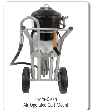
Hydra-Clean Air-Operated Cart-Mount