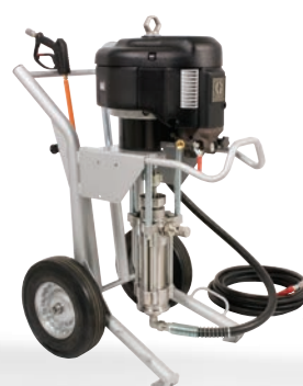
Hydra-Clean Air-Operated Cart-Mount