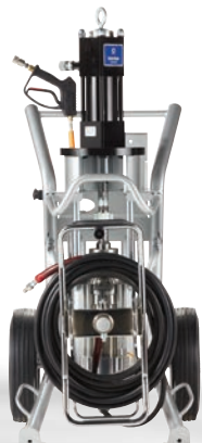
Hydra-Clean Hydraulic Cart-Mount*