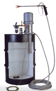
Hydra-Clean Air-Operated 10:1 Drum-Mount