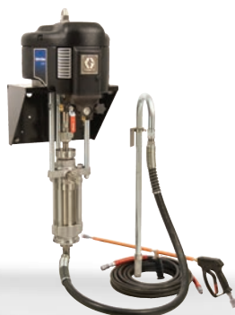
Hydra-Clean Air-Operated Wall-Mount