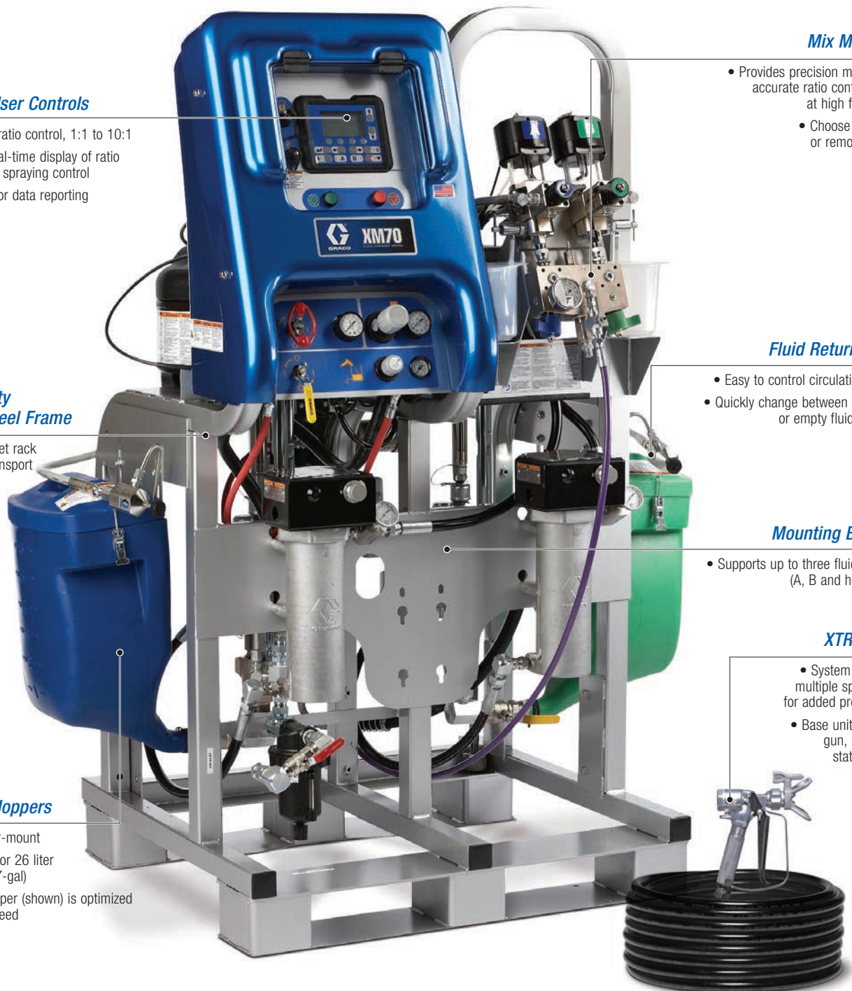
Graco XM Plural-Component Sprayer (base model with 26 liter hoppers)*