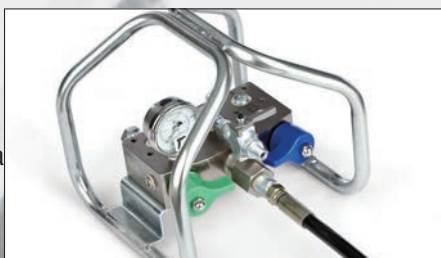
Remote Mix Manifold

Material mixing reaches a new level of precision due to new dosing technology. With the Graco XM, the minor component (or side B material) is injected at high pressure into the major material (side A). Advanced sensors allow pumps to compensate for pressure fluctuations, resulting in accurate, on-ratio mixing for better yield and less waste.