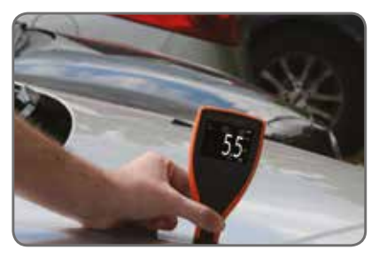
Measures on steel & aluminium body panels <sup>2</sup>

Switches instantly to measure coatings on steel & aluminium<sup>2</sup>